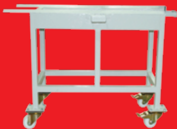
Wheeled Loading and Transport Table Rail System