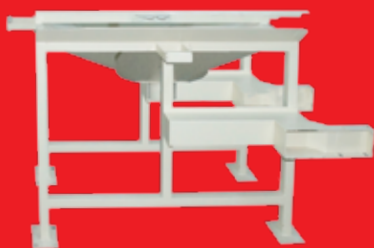
Loading And Handling Table Wheeled with Rail System